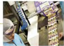
BEGA CHEESE MANUFACTURE 11-13 Lagoon Street Bega NSW 2550 Australia