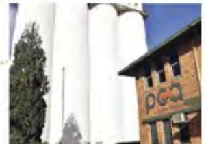
KINGAROY 133 Haly Street Kingaroy QLD 4610 Australia