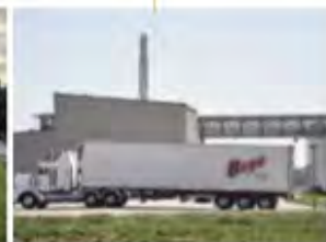
STRATHMERTON Murray Valley Highway Strathmerton VIC 3641 Australia