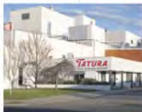
TATURA 236 Hogan Street Tatura VIC 3616 Australia