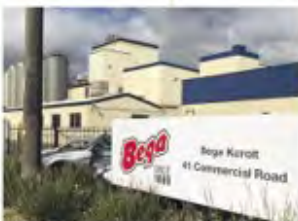
KOROIT 41 Commercial Road Koroit VIC 3282 Australia