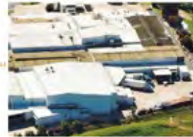
BEGA HEAD OFFICE AND PROCESSING & PACKAGING PLANT 23-45 Ridge Street Bega NSW 2550 Australia