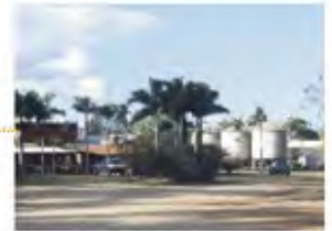
TOLGA 12 Tostevin Street Tolga QLD 4882 Australia