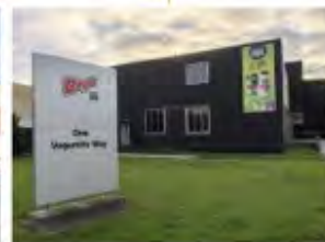
PORT MELBOURNE 1 Vegomita Way Port Melbourne VIC 3207 Australia