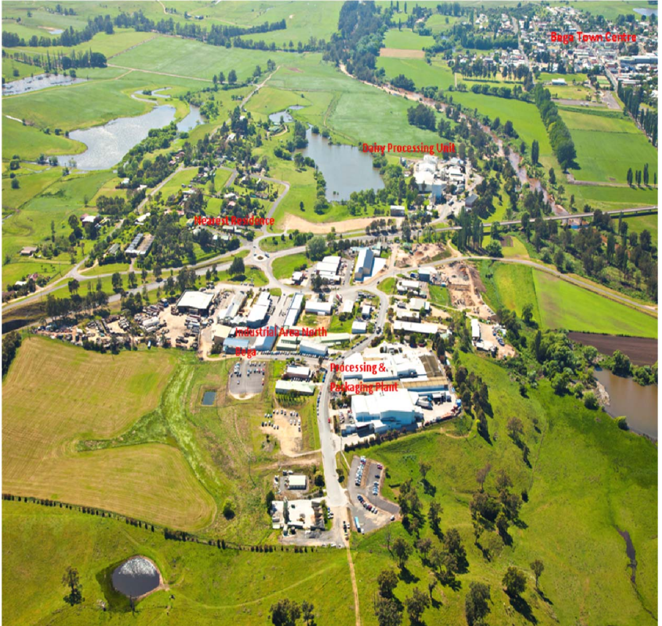
Figure 2 Potentially Impact areas & the Greater Bega Area