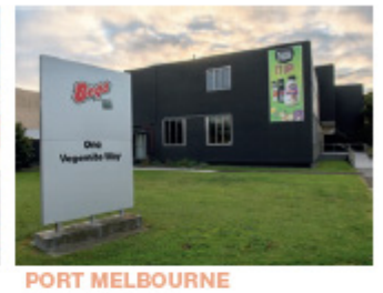
1 Vegemite Way Port Melbourne VIC 3207 Australia